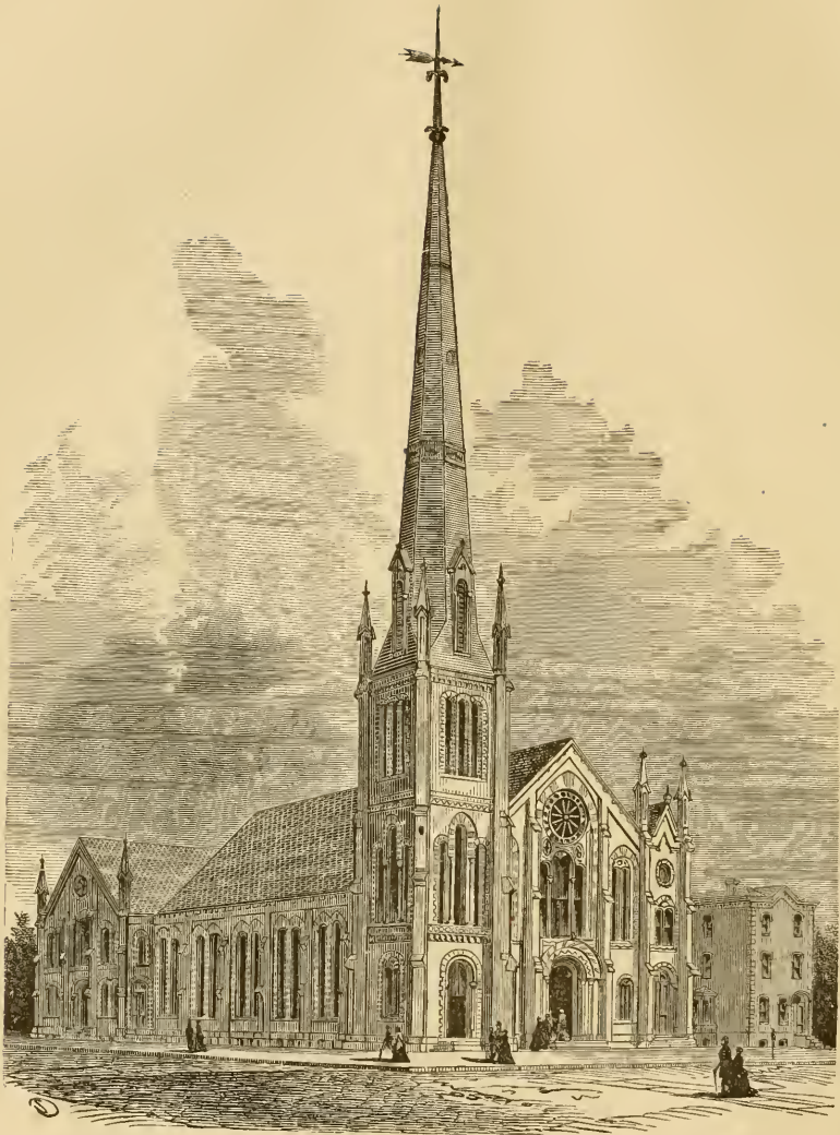
FIRST PRESBYTERIAN CHURCH, CAMDEN, N. J. Corner Stone laid June 22, 1871. Dedicated June 1, 1873.